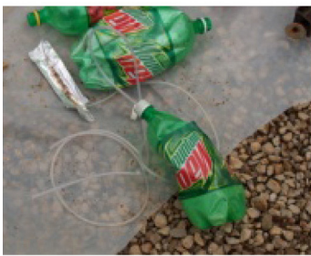
Any containers with plastic tubing or hoses