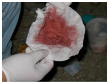
Quantities of coffee filters or paper towels with unusual stains