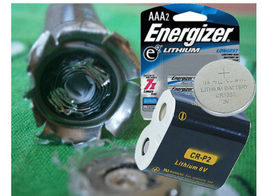
Disassembled lithium batteries