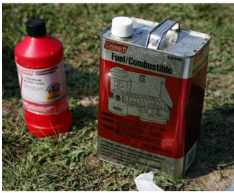
Flammable solvents: starting fluids, Coleman Fuel, camping fuel, paint thinner, etc.