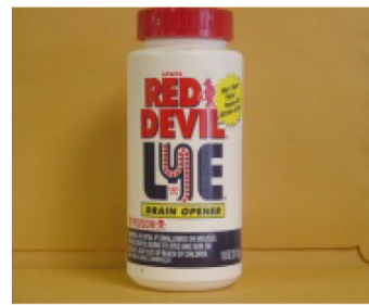
Lye ("Red Devil"), Crystal Drano, or other drain cleaners.