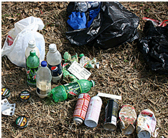
Trash bags with an ether, solvent, or ammonia odor.