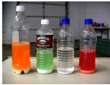
Any container with "bi level" liquids