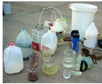
Large quantities of glass and plastic containers, buckets, plastic hose