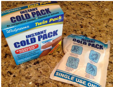
Cold packs containing ammonium nitrate