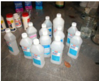
Containers such as muriatic acid, iodine, or hydrogen peroxide