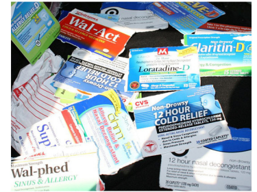
Loose pills or packaging from pills that contain ephedrine or pseudoephedrine