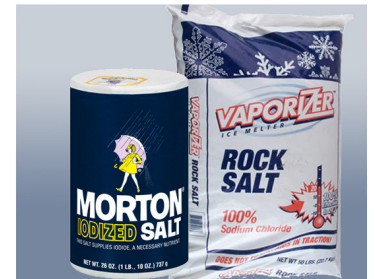
Table or rock salt

Finding any of these items clustered together could be an indication of meth lab waste. If you find any of the items above or similar products, DO NOT touch, smell, or examine them.