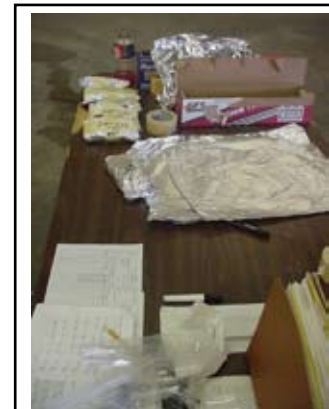
Fish fillets being prepped for testing at the MDCH Lab in Lansing, Michigan.

By using the Michigan Fish Advisory , you can see which fish have been tested for chemicals and are safer for you and your family to eat.