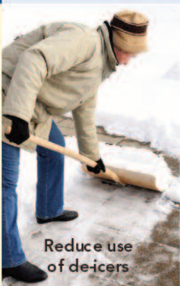
Reduce use of de-icers