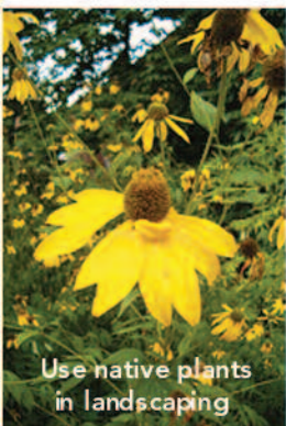
Use native plants in landscaping