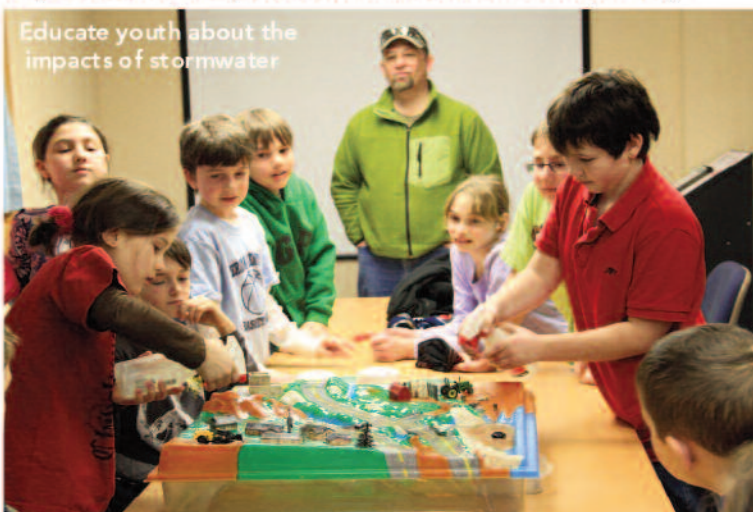
Educate youth about the impacts of stormwater

The health of our waters depend on the actions we take today, and are best addressed by a comprehensive and coordinated plan to collect accurate data and outline sensible steps to restore and protect the waters of Little Traverse Bay.