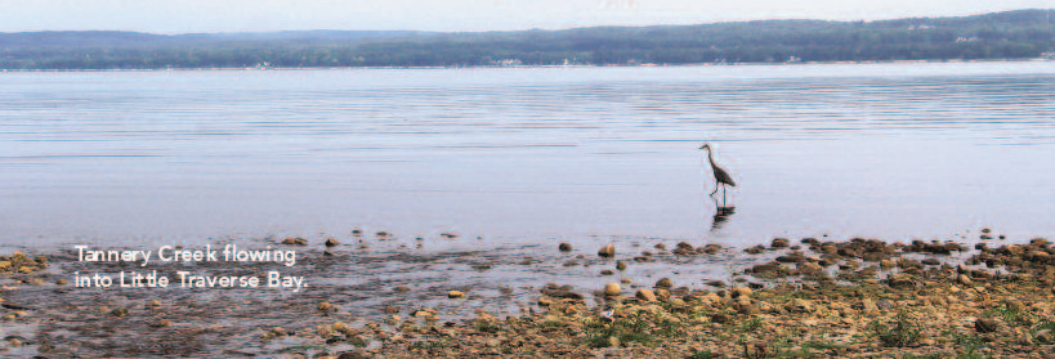
Tannery Creek flowing into Little Traverse Bay.

It is clear that the biggest impact on Little Traverse Bay comes from those of us living in its Watershed. For more than two centuries we have altered the landscape to suit our needs and in the process, brought dramatic change. By bringing together our communities to implement the Little Traverse Bay Watershed Protection Plan, we have the opportunity to protect, restore, and enhance the Bay for future generations to enjoy.