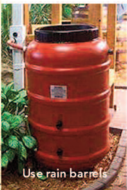
Use rain barrels