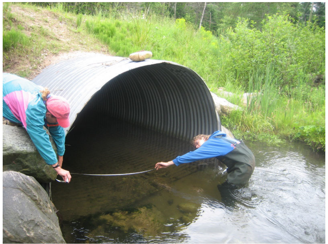
Volunteers measuring culvert dimensions at Tyler Road on Cold Creek.