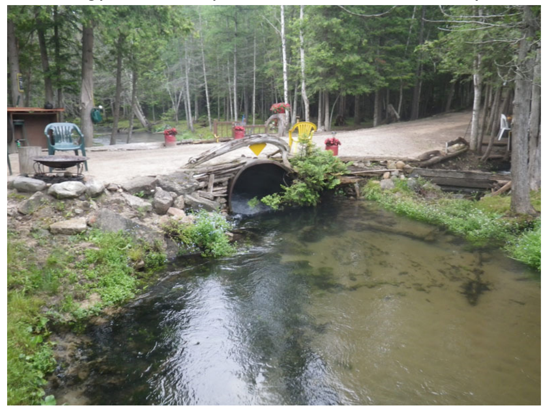
Culvert inlet and scouring pool on private road on Cold Creek.

The following photos are examples from the Grass River RSX Inventory: