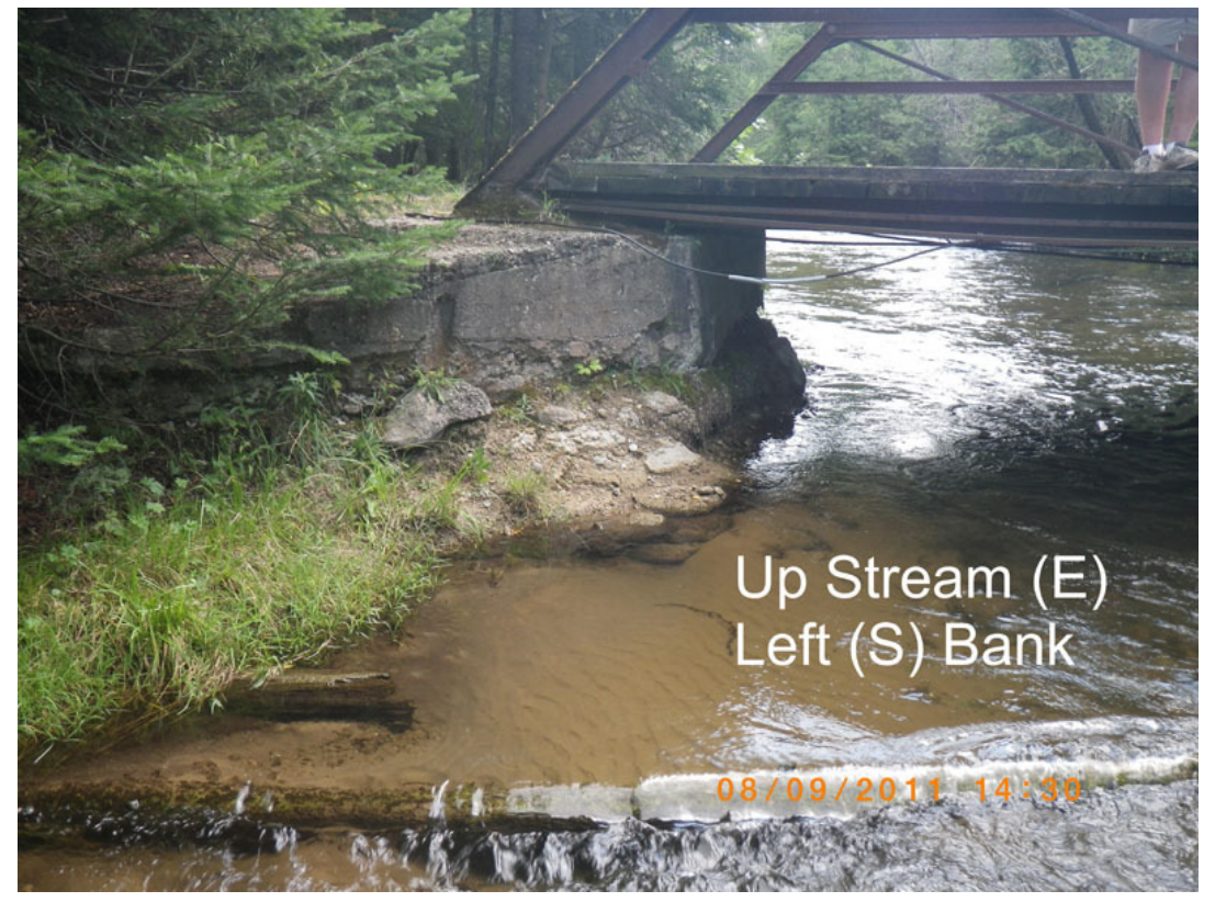
Dilapidated bridge over the Rapid River at Glade Valley Road.