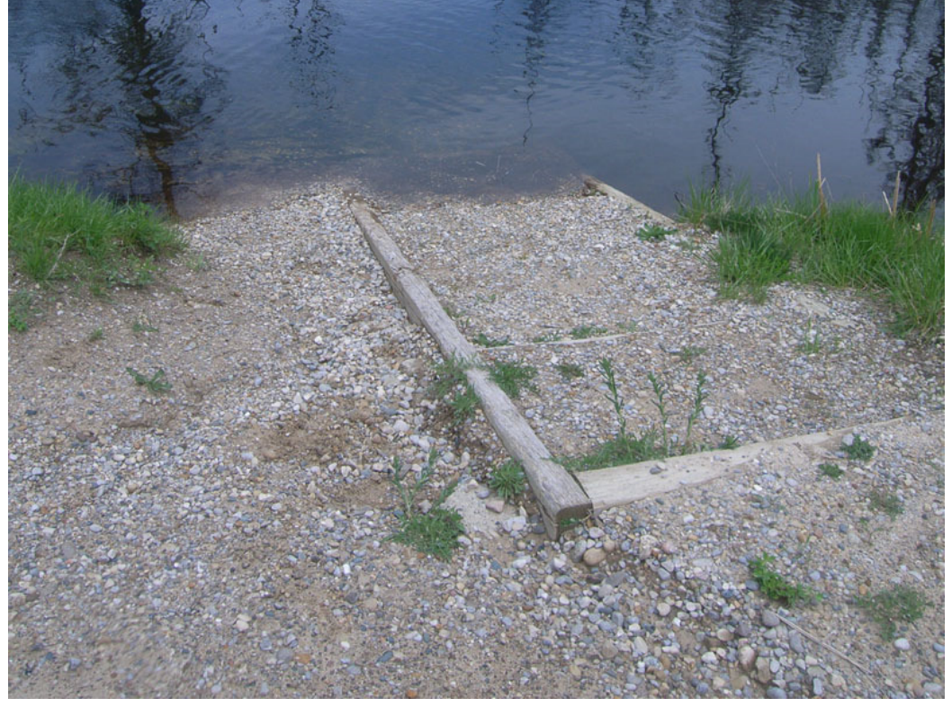
Sediments wash into the Little Rapid River at access point on Old M72.