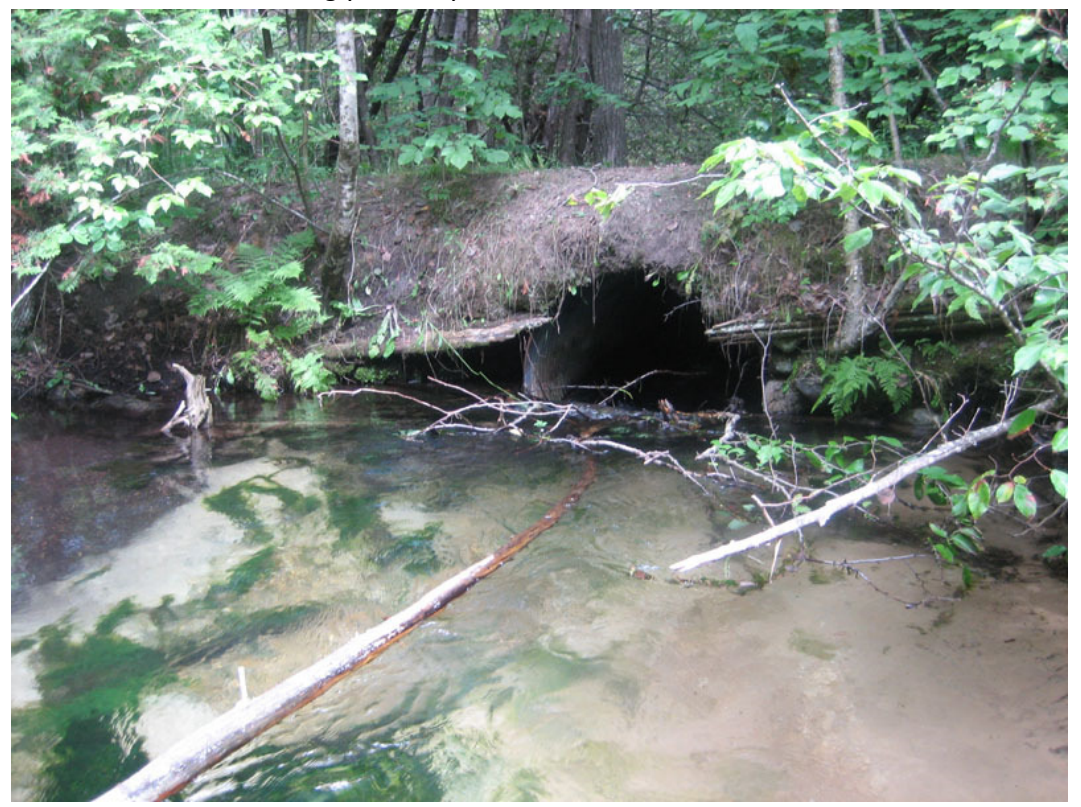
Culvert inlet with eroding upper bank at Elder Road East on Finch Creek.