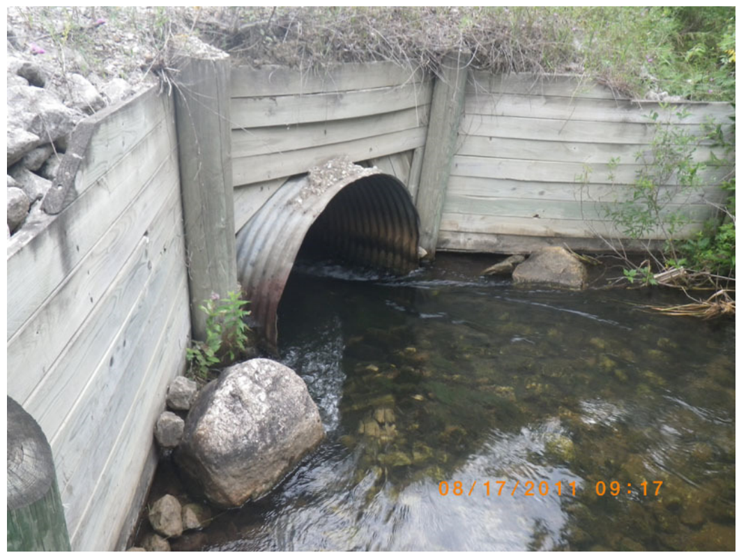
Sediments fall on to the culvert and into the Little Rapid River at Hill Road.

The following photos are examples from the Rapid River RSX Inventory: