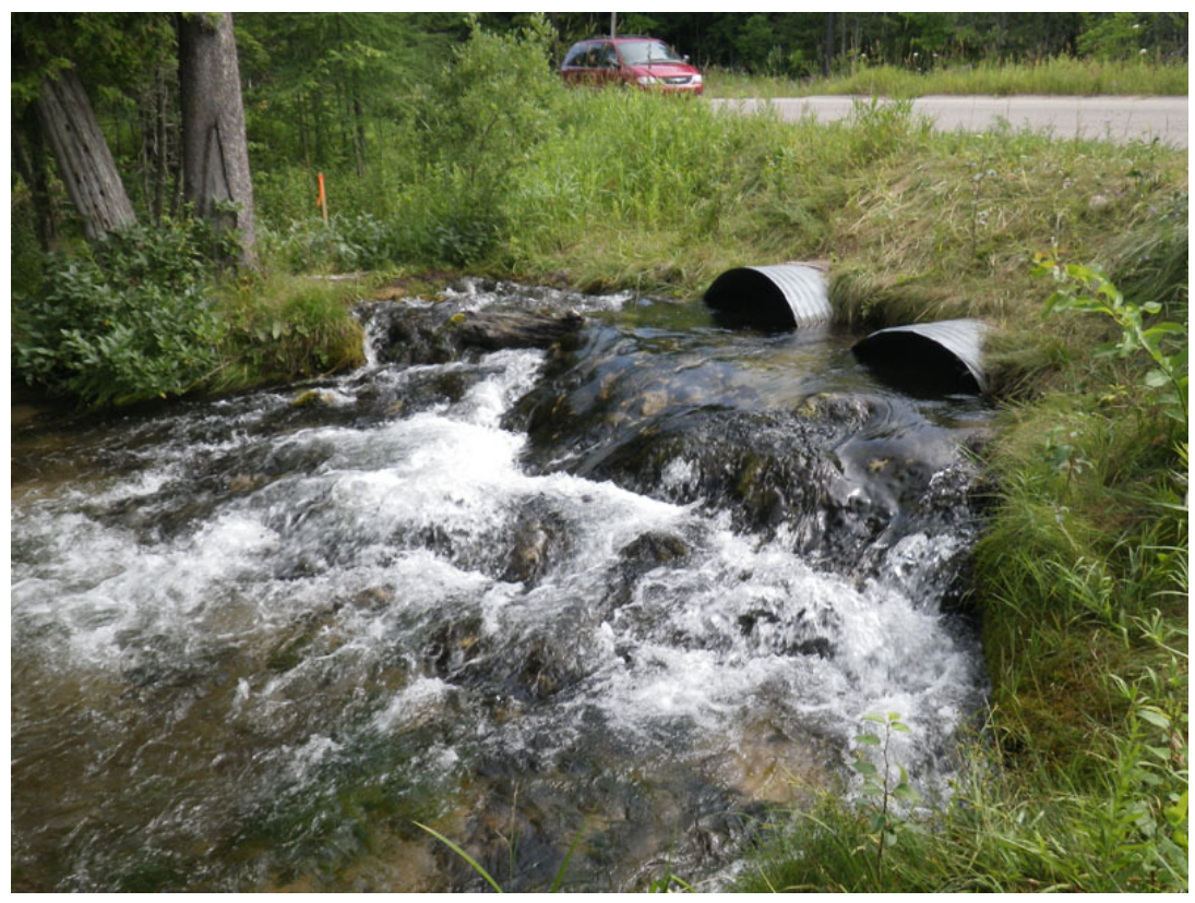
Cascade over riprap at Finch Creek Road creates aquatic species passage barrier.