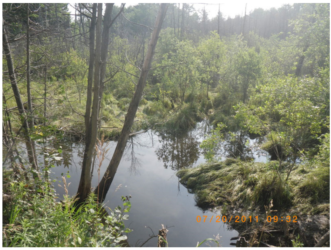
Water ponds upstream of undersized culvert at Priest Road in the headwaters.