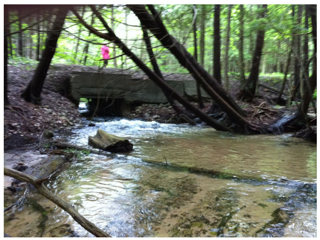
Aging concrete bridge over Shanty Creek on Creekside Drive.