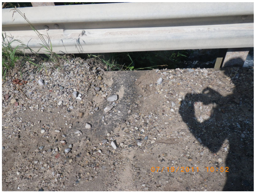
Sediments pour into the Rapid River from the bridge at Dundas Road.