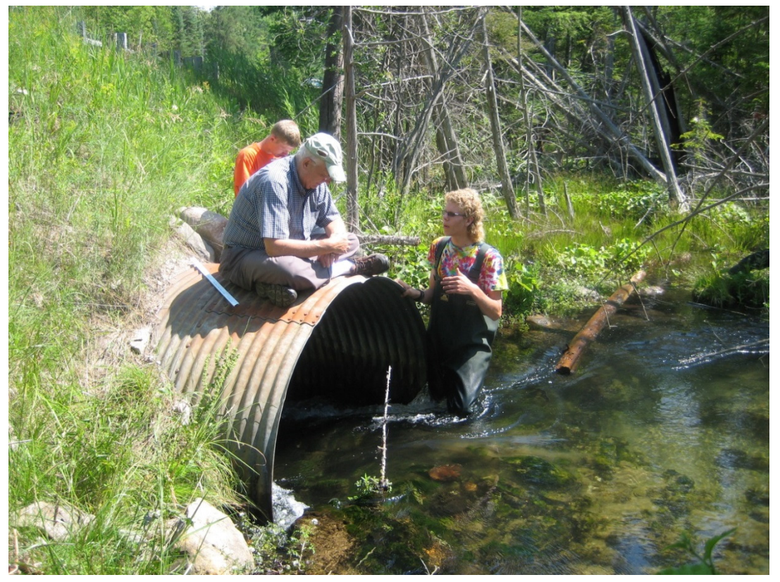
Volunteers assessing road-stream crossing at Comfort Road on Cold Creek.