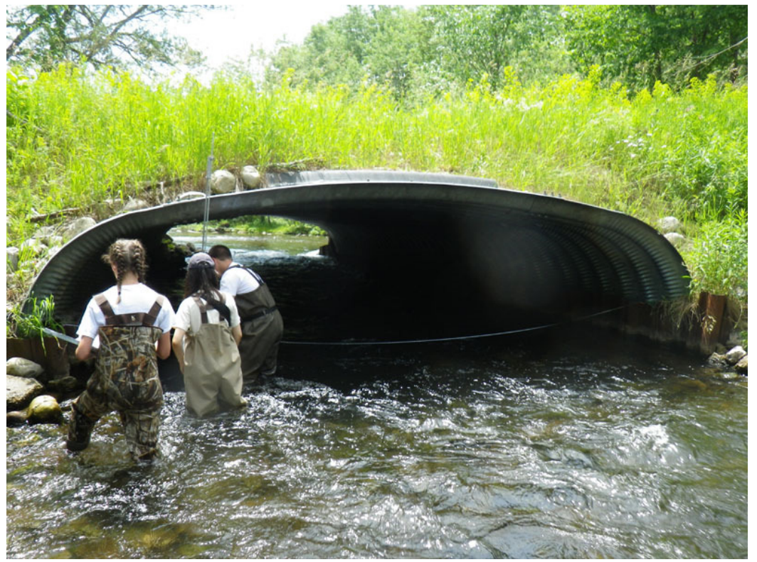
Volunteers help assess stream conditions at the Wood Road crossing.